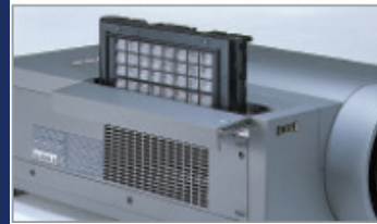
▲ Top –accessed self-advancing 10-exposure cartridge air filter reduces maintenance.