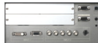
XGA native resolution with scaling for VGA to UXGA and HDTV Video up to 1080p for compatibility with most computers and video sources.